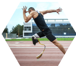
MIRROR: Musculoskeletal Injury Rehabilitation Research for Operational Readiness