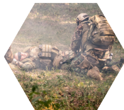
AREVA Research Institute & Innovation Center, A Program of The Geneva Foundation