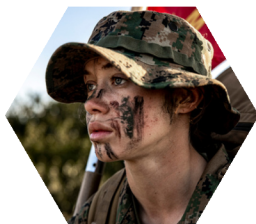
FLRI: Fort Liberty Research Institute, A Program of The Geneva Foundation