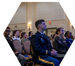
TSNRP: TriService Nursing Research Program